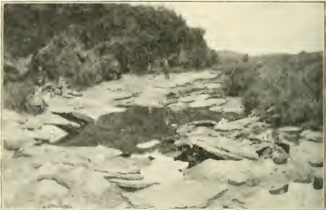
THE HAUNT OF KA KMA KHARAI.

When it was discovered that she was with child, she fled from her home, fearing the wrath of her father, and put herself under the protection of her maternal uncle, who lived in the Pomdoloï cave, and was one of the famous dragons, or Yak Jakors of the country.