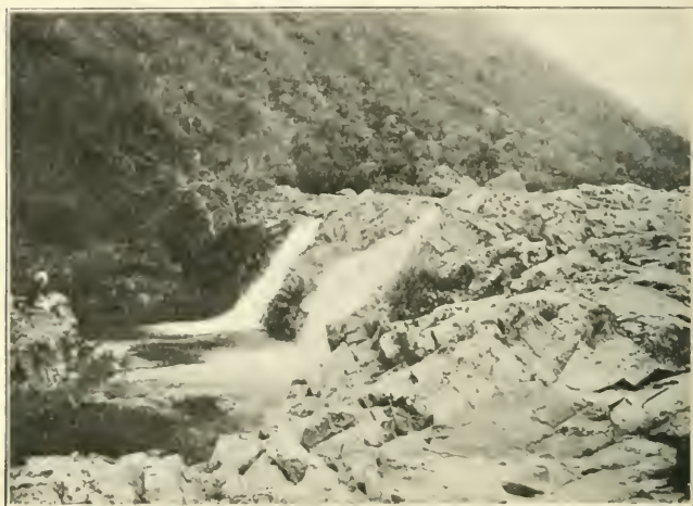
AT THE FOOT OF THE MOUNTAIN OF THE IEI TREE.

On the summit of the mountain there grew a tree of fabulous dimensions—the Iei Tree—which dwarfed even the largest trees in forests. It was of a species unique, such as mankind had never known; its thick outspreading branches were so clustered with leaves that