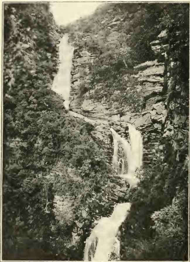
IN THE NEIGHBOURHOOD OF THE MOUNTAIN OF THE IEI TREE.