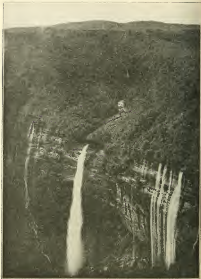
THE LEAP OF KA LIKAL.