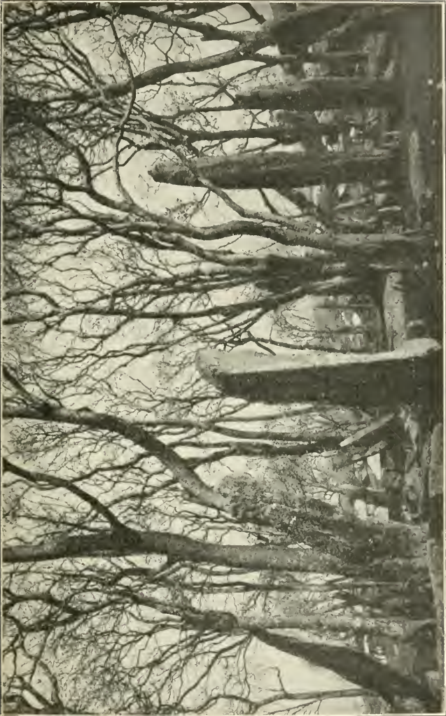
SACRED GROVE AND MONOLITHS.