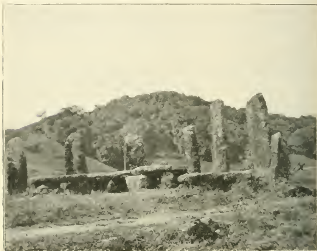
▲ VIEW IN THE REPUTED REGION WHERE U RAMMAH THE GIANT COMMITTED HIS ATROCITIES.

In the course of time they took to themselves wives and became the heads of families. U Riwbha's wife, like himself, belonged to one of the wealthy families, so that by his marriage his influence in the village increased, and he became very rich and prosperous. U Baduk also married into his own class and went to live in a distant