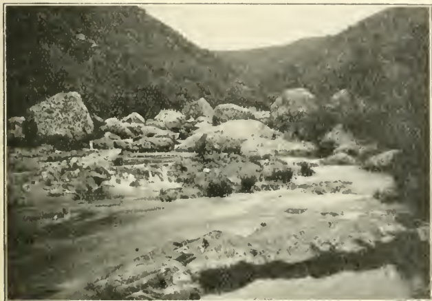
AT THE FOOT OF MOUNT SHILLONG.