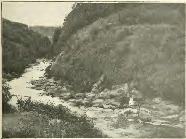
AT THE FOOT OF THE SHILLONG MOUNTAINS.

dise, but the dog, being of an indolent nature, did not like to work, though he was very desirous to go to the fair. So, to avoid the censure of his neighbours and the punishment of the governor of the fair, he set out in search of something he could get without much labour to himself. He trudged about the country all day, inquiring at many villages, but when evening-time