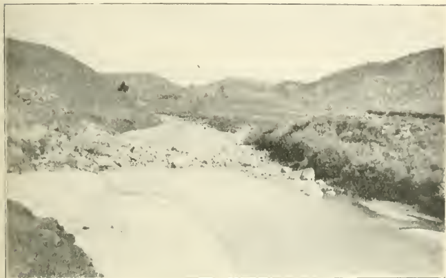
THE REPUTED HAUNT OF U KSUID TYNJANG.

To lure people into his grasp, he used to imitate the human voice and to shout " Kaw-hoit, Kaw-hoit! " the common signal-cry of people who lose their companions or their way—a cry to which all humane travellers