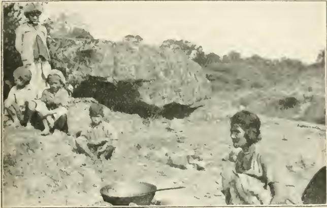
A KHASI INDUSTRY—FRYING FISH IN THE OPEN AIR.

It happened that the daughter-in-law was absent that night, so that the stranger saw only the parents and their son.